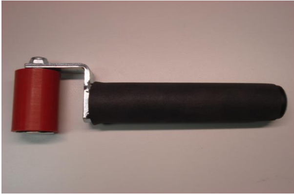
2" Roller GSS & Advanced Elite Installation