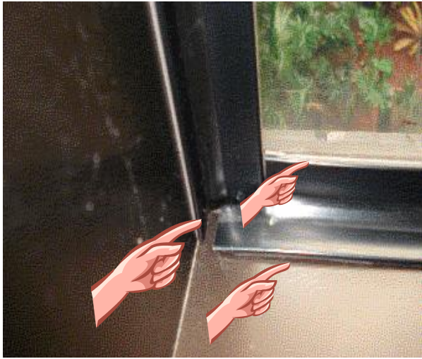
Fig 1 • Excessive gap • Improper adhesion