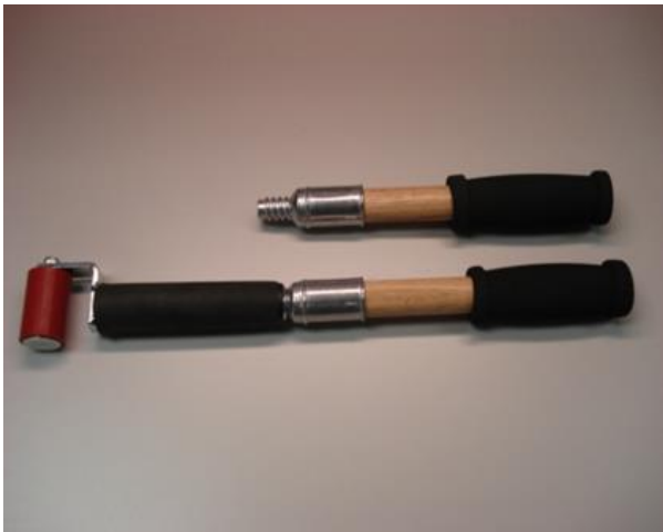
12" Extension Handle

Tools can be ordered directly from Pentagon Protection US by calling 1-614-264-0147