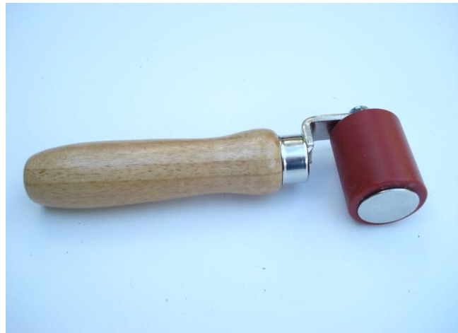
1 3/4" Roller GSS & Advanced Elite Installation

Tools can be ordered directly from Pentagon Protection US by calling 1-614-264-0147