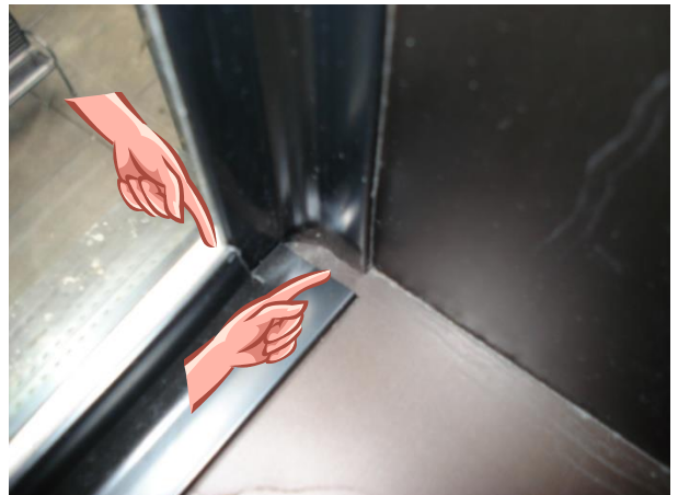
Fig 4 • Overlap • Excessive gap