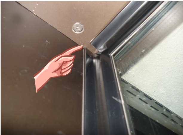
Fig 3 • Excessive gap