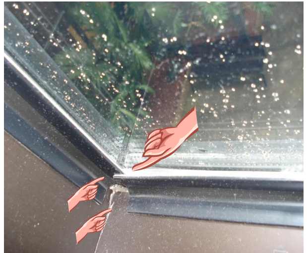
Fig 2 • Overlap • Poor cleaning • Excessive gap • Improper adhesion